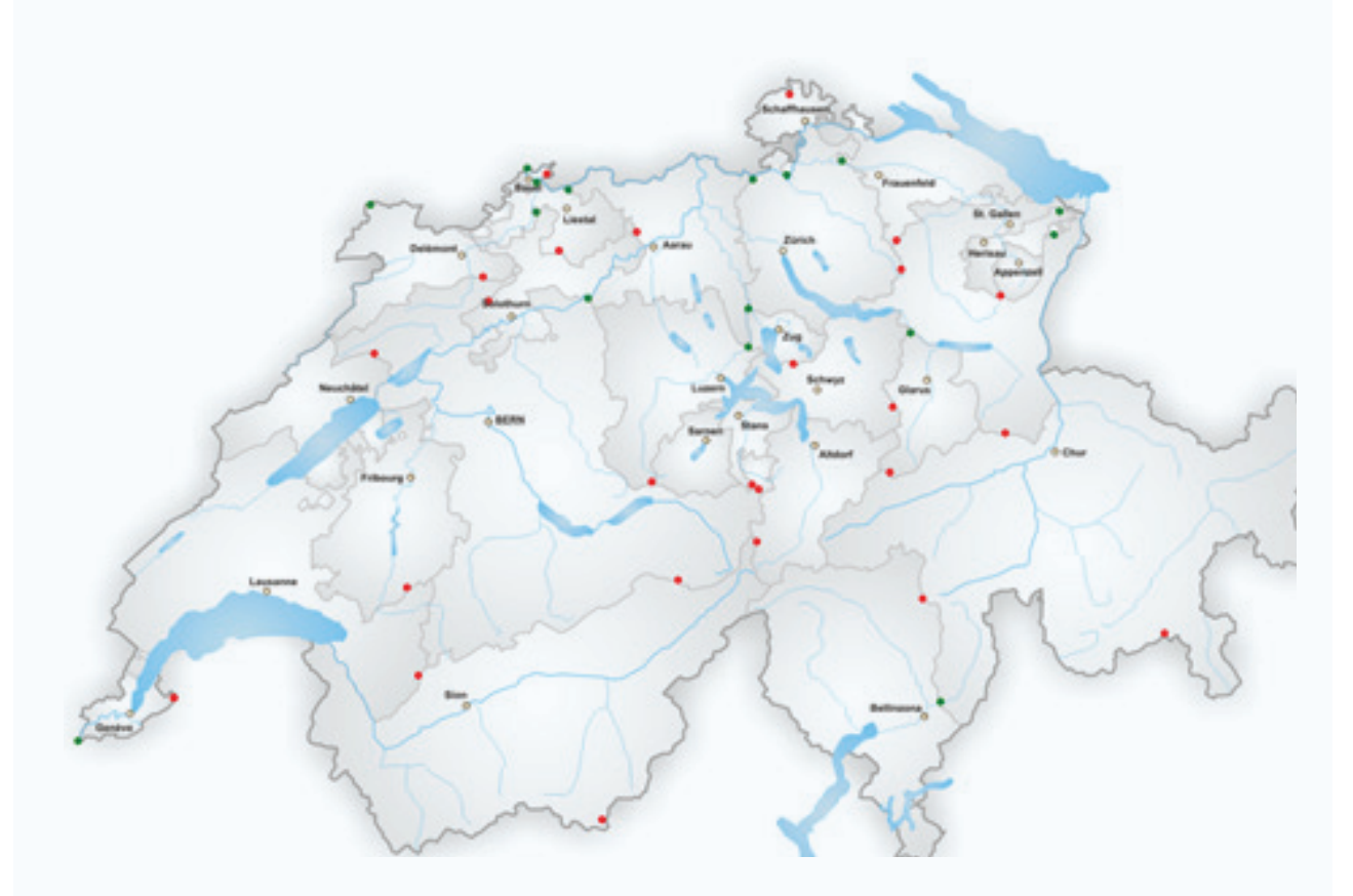
Exhibit 1: Blockchain nodes in Switzerland for the Swiss "Crypto Franc"

"Crypto Franc" will be implemented as a cryptocurrency on a hybrid blockchain. While the chain is open for all to participate there will be permissioned nodes federated via all Swiss Cantons using the consensus mechanism, which guarantees adherence to the rules and regulations defined by the Swiss regulator. The Blockchain protocol will focus on low energy usage, high throughput, security and stability. It allows deployment of smart contracts that can be used for a large variety of business and e-government purposes. In addition, the Swiss National Bank (SNB) guarantees the exchange of Swiss Francs against "Crypto Francs" 1-to-1, i.e. the "Crypto Franc" is pegged to the Swiss Franc.